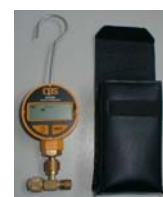
LCD VACUUM GAUGE (CPS) P/N TES3288