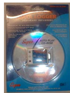
DATA LOGGER P/N TESL200