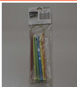
FIN COMB SET P/N TE21126