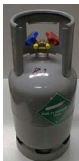
12 LITRE STORAGE CYLINDER P/N 624135