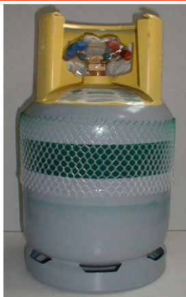
20 LITRE RECLAIM CYLINDER P/N TE70021