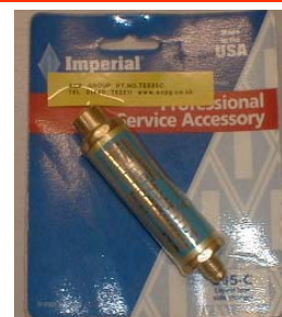
KWICK CHARGER P/N TE535C