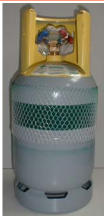
12 LITRE RECLAIM CYLINDER P/N TE70024