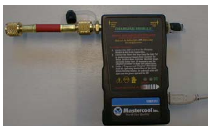
CHARGING SOLENOID MOD- ULE FOR TE98210 P/N TE98230