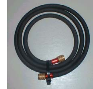
72" 3/8 FLARE HD HOSE YELLOW P/N TEHDSBGG1800B