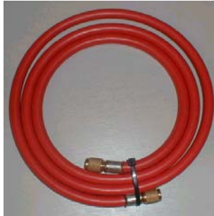
72" 1/4 FLARE HOSE RED P/N TENFSAGG1800R