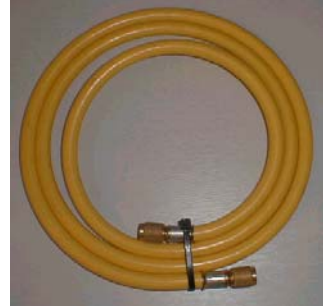
72" 1/4 FLARE HOSE YELLOW P/N TENFSAGG1800Y