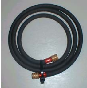
72" 3/8 FLARE HD HOSE BLUE P/N TEHDSBGG1800B