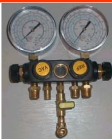
4 VALVE MANIFOLD GAUGE P/N TE4VR134A