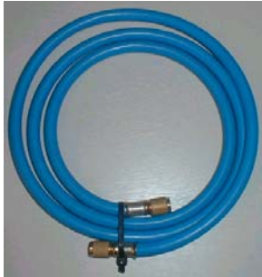
72" 1/4 FLARE HOSE BLUE P/N TENFSAGG1800B