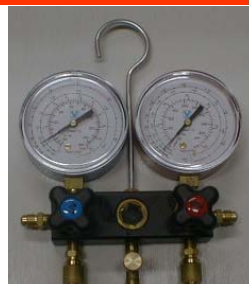
2 VALVE MANIFOLD GAUGE P/N TE134AG