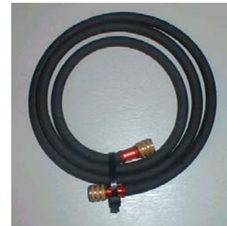
72" 1/4 FLARE HD HOSE YELLOW P/N TEHDSAGG1800R