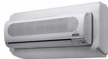
Inside Only Unit