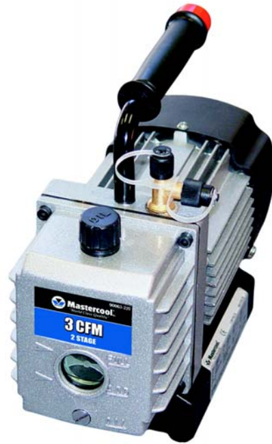
VACUUM PUMP 3.0 CFM 2 STAGE COST £230.00 P/N TE 90063-2V