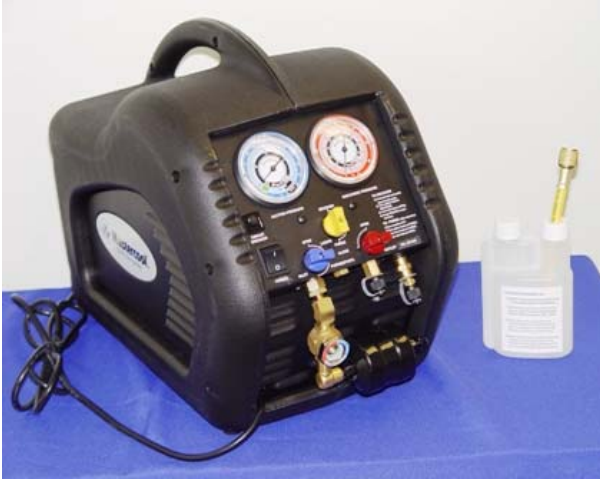
MASTERCOOL RECOVERY & RECYCLE UNIT 110V COST £699.00 P/N TE 69200-110V